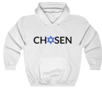
Chosen Hooded Sweatshirt