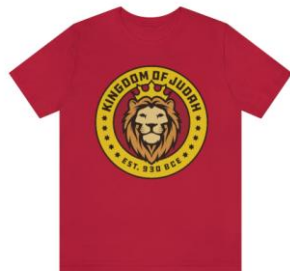
Kingdom of Judah T-shirt