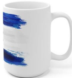
Israeli Flag Ceramic Mug