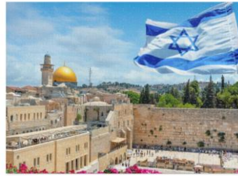
Temple Mount Puzzle (252, 500, 1000-Piece)