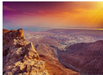
Masada Sunrise Puzzle (252, 500, 1000-Piece)