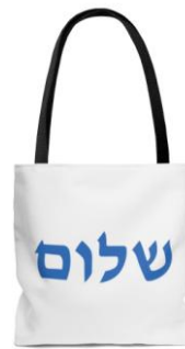
Shalom Tote Bag