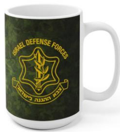
IDF Ceramic Mug