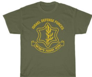
IDF Cotton Tee