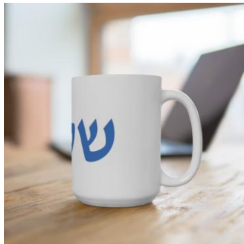
Shalom Ceramic Mug