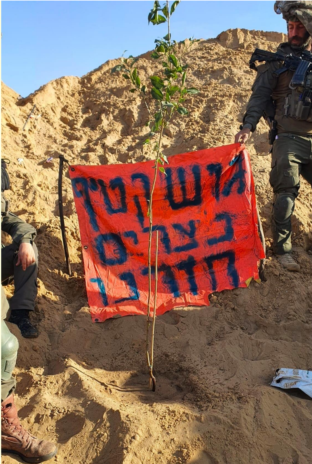
First time back since 2005, planting a tree, with a sign: Gush Katif Netzarim We have returned!